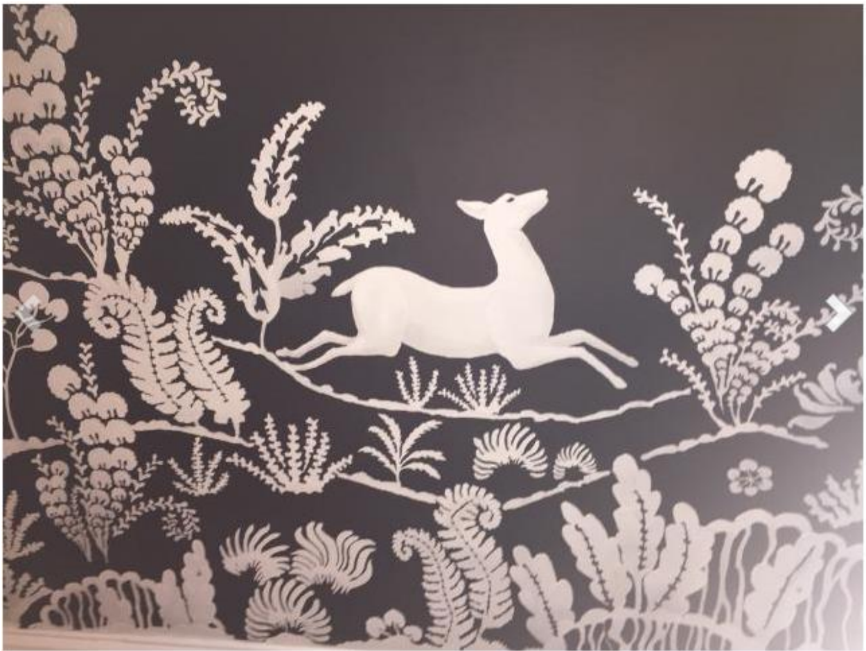
SAVAGE Interior Design