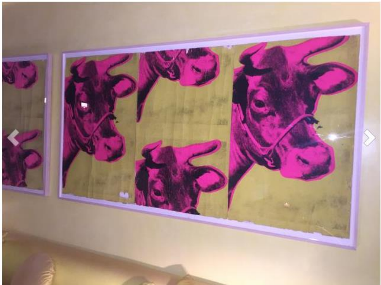
Robert A.M. Stern Architects