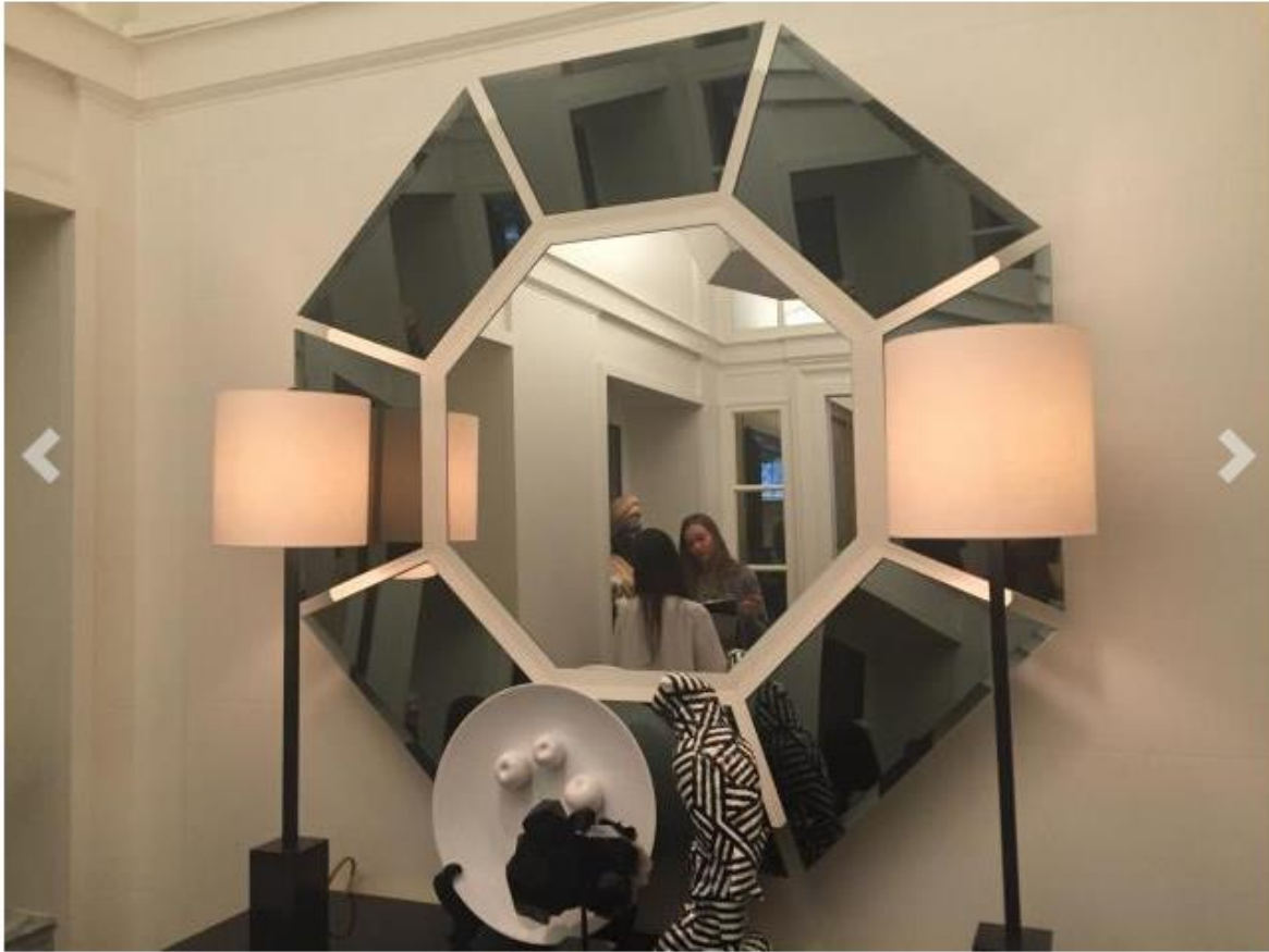
Powell & Bonnell